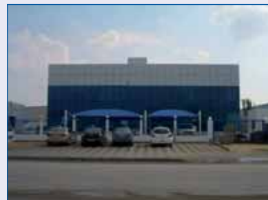
New state-of-the-art facility